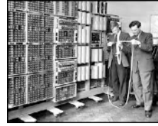
CHOOSING A COMPUTER