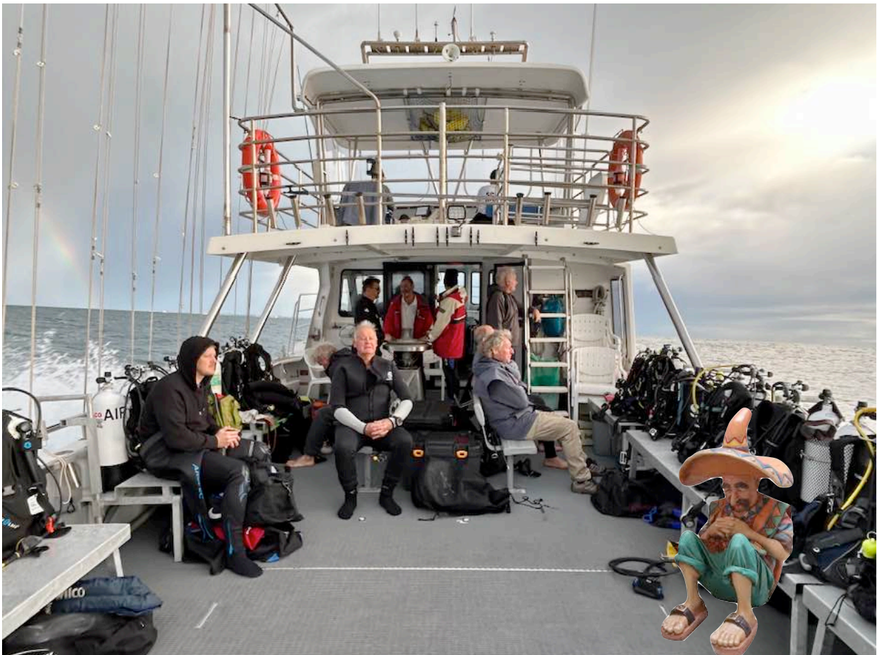
Heading home tired but happy.

The weather had not been kind to the regular diving faithful, so with some trepidation, the true aquatic believers faced the next scheduled monthly outing and hoped that this time would be