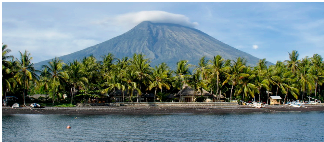
Tulamben Village from the sea

Overall, my favourite sea creatures out of my dives during my trip were, the mantas in Nusa Penida (of course!), then the ghost pipefish in Tulamben and the colourful frogfish .